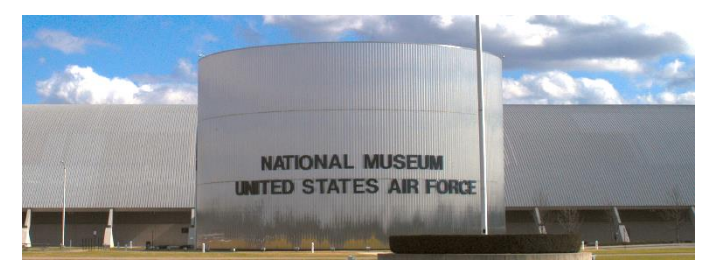
The National Museum of the U.S. Air Force galleries present military aviation history, boasting more than 360 aerospace vehicles and missiles on

And then the location where the action took place - Huffman Prairie . This is the actual site with a replicate to the catapult used by Orville and Wilbur. If available, a park ranger will provide a detailed summary of the time the brothers spent in this field and guests can get out or stay on the air-conditioned coach. Limited walking at these two sites.