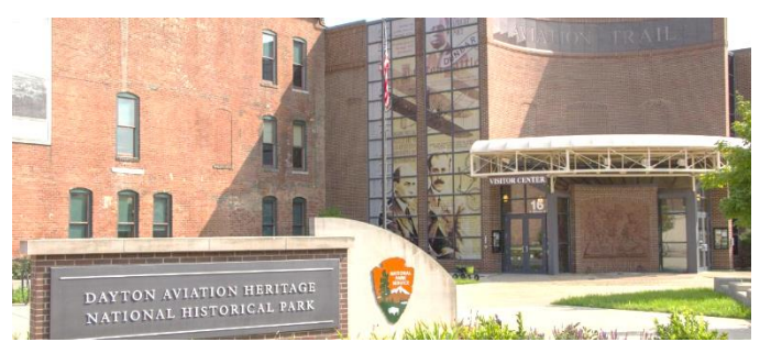
Dayton Aviation Heritage Park, Wright Brothers Interpretive Center. Tour this small museum depicting the life of Wilbur and Orville Wright and the early days of flight.

The reunion dates are Sept. 29 thru Oct. 3, 2021. The Crowne Plaza is easy access off I-70 and airlines into Dayton International Airport include Allegiant, American, Delta and United. There are several nonstop flights out of major hubs. Our hotel offers a free shuttle to and from the airport. Rental car companies at the airport are Alamo, Avis, Budget and Enterprise. We have scheduled two tours on Thursday.